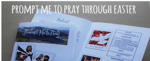
This 44 page, illustrated 8.5"x5.5"

NEW Craft Kit! Approved by 2 Priests, A BISHOP, and an Accountant