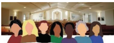
St. Mark's Women's Ministry

The women of St. Mark's Parish are invited to attend the April Women's Ministry gathering downstairs in the parish hall. There will be snacks and small group discussions. For more information, please email stmarkswomensministry@gmail.com .