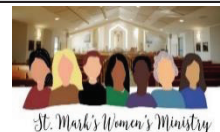
St. Mark's Women's Ministry

The Women's Ministry will be holding their last meeting before the summer on Monday, June 5 th at 7:30 pm. All the women of the parish are invited to take part. We look forward to seeing you there!