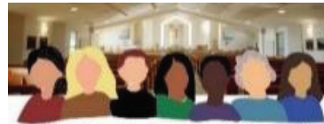
St. Mark's Women's Ministry

The Women's Ministry is joining forces with the Stouffville Food Bank to create 120 gift bags filled with personal items for women. These