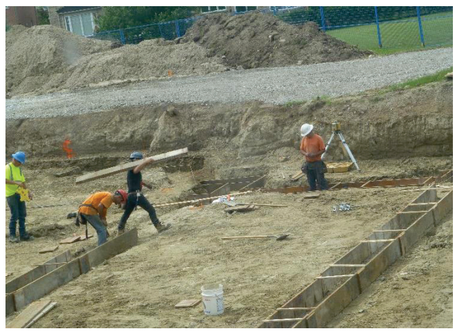
Building the forms for the footings & foundation