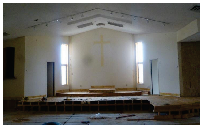
Demolition of the sanctuary floor