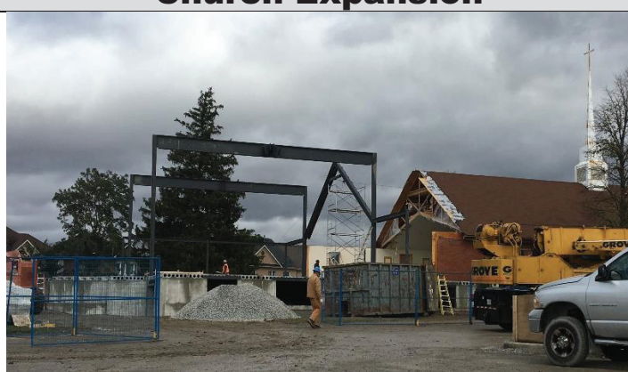
Concrete floor slabs in place for main level. Installation of metal framing has begun.