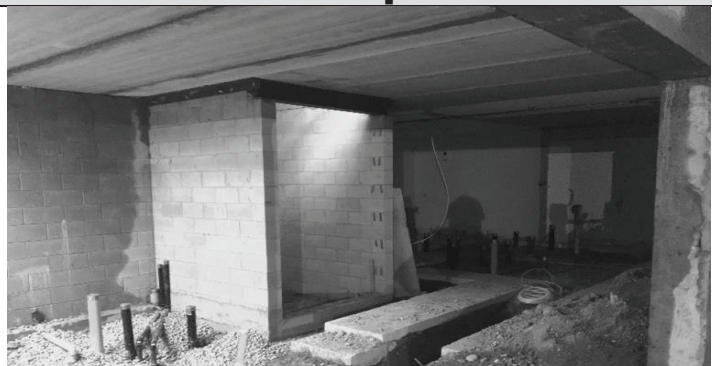
Elevator shaft as seen from the parish hall