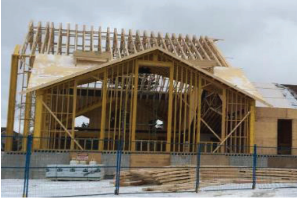
Roof almost complete