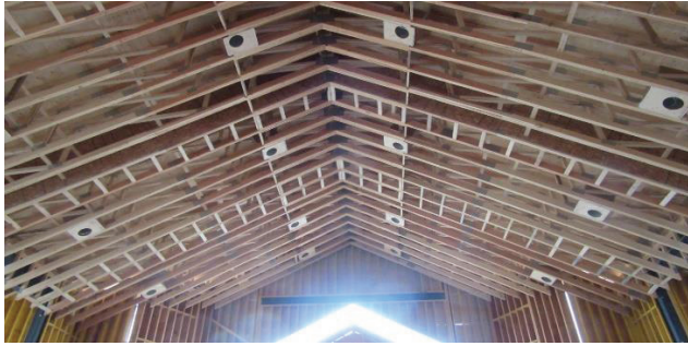
Progress is being made inside the Church