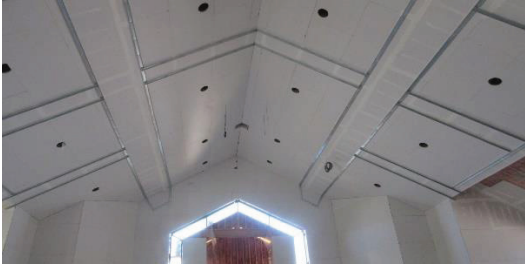
Ceiling completed & work started on new side entrance.