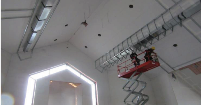
Installing more duct work and doorways.