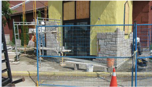
New Side Entrance

Lots of progress was made over the summer months!